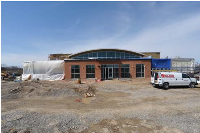
FRONT ENTRANCE OF THE SERVICE CENTRE

“THIS STATE OF ART FACILITY WILL BE COMPLETELY SELF-SUSTAINING THROUGH THE USE OF ON-SITE EMERGENCY GENERATION”