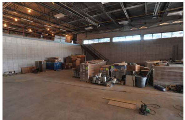
INVENTORY CONTROL STORAGE