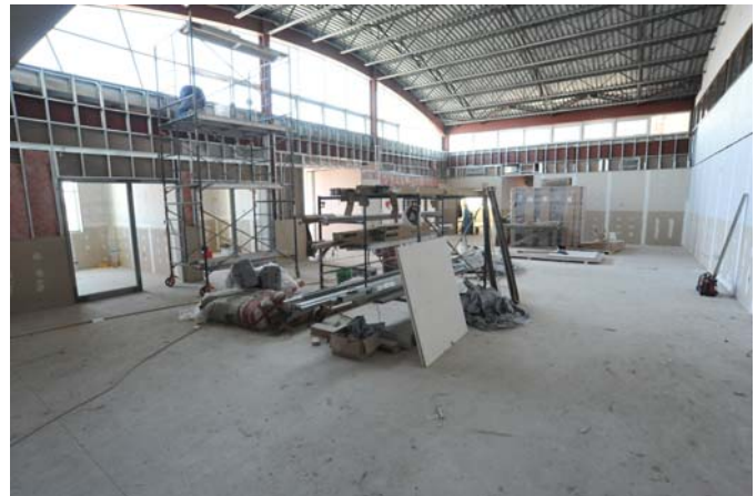
FRONT RECEPTION AREA OF SERVICE CENTRE